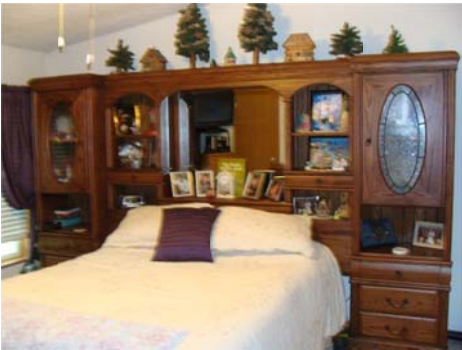
Master Bedroom – 12'5" x 12'8"