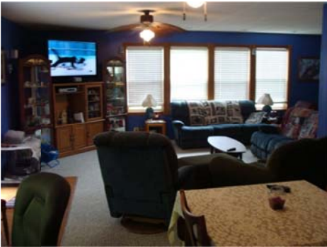
Recreational Room – 12'8" x 26'11"