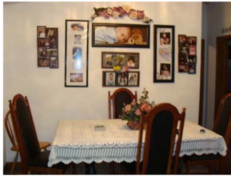
Dining Room – 10'2" x 9'8"