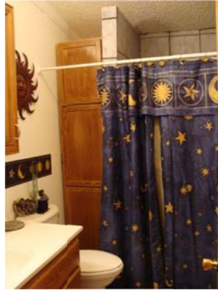
Bath – 5'3" x 5'