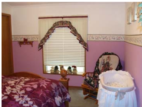
Bedroom – 11'9" x 11'7"