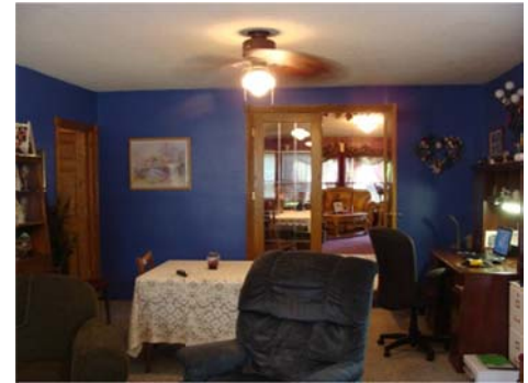
Dining Area – 14'6" x 15'