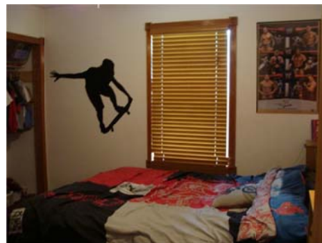
Bedroom – 12'5" x 10'3"