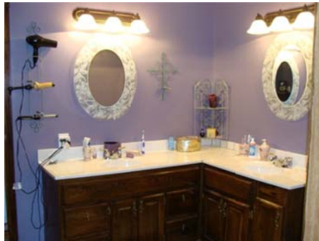
Master Bath – 7'3" x 12'11"