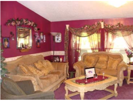
Living Room – 16' x 17'8"