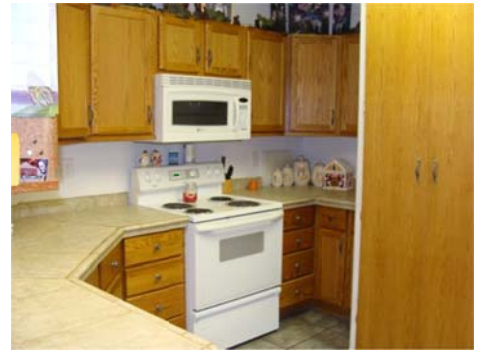
Kitchen – 11'7" x 15'8"